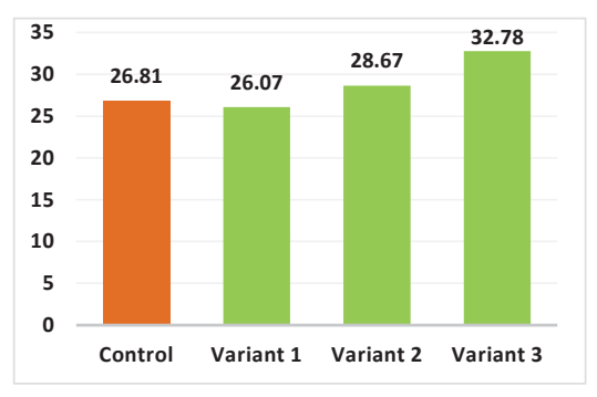
Figure 1. The effect of the application of different doses of suspension alginite (Variant 1 - Variant 3) on the height of plants (mm) of hemp ( Cannabis sativa L.).

Figure 2. The effect of the application of different doses of suspension alginite (Variant 1 - Variant 3) on the weight of plants in the dry state (g) of hemp ( Cannabis sativa L.)