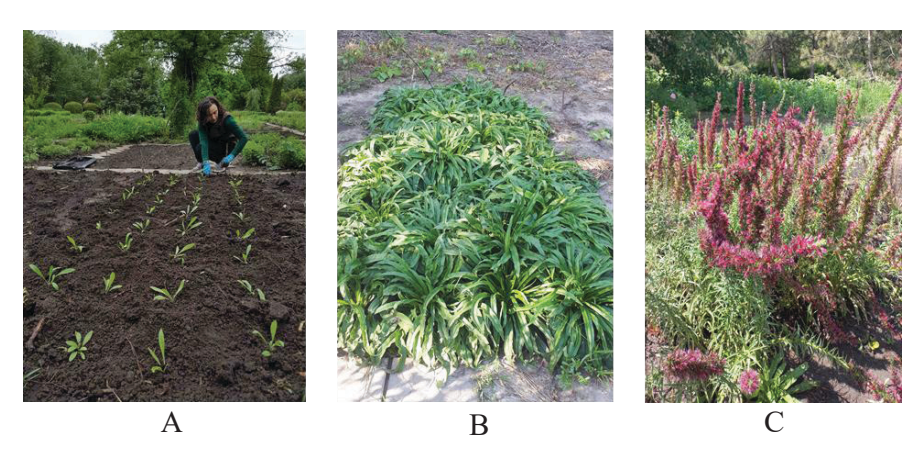
Figure. Pontechium maculatum (L.) Böhle & Hilger in ex-situ collection (A – spring of 2021; B – autumn of 2021; C – summer of 2022)

Conclusions. The way of conservation of a species is determined by its ecological, genetic, biological characteristics and the analysis of the reasons that brought the species to a step of being rare in nature. Based on our preliminary studies, we can say that the main limiting factor is the degree of excessive destruction of habitats, which affects the reproduction capabilities of the species, and the best measure for conservation is in situ protection of local populations as well as its multiplication in ex-situ conditions and repopulation of suitable natural habitats.